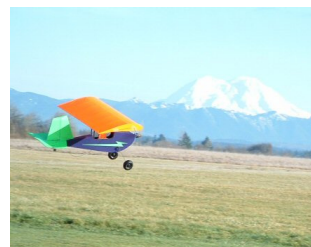
Horty's FredE maiden flight