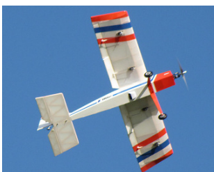
Dave Cleavenger's Ultra Stick